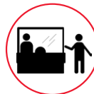
EXHIBIT BOOTHS AND BADGES

TO MEET THE DEMANDS OF GROWING PHYSICIAN ATTENDANCE, CiDA 2017 WILL OFFER A GREATER NUMBER OF MARKETING OPPORTUNITIES THAN EVER BEFORE.