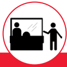
EXHIBIT BOOTHS AND BADGES

The promotional opportunities available to CiDA Exhibitors are designed to address a wide range of business goals, and accommodate budgets of all sizes. Please contact us at exhibitsales@ccmcm.com to discuss your company's CiDA strategy further.